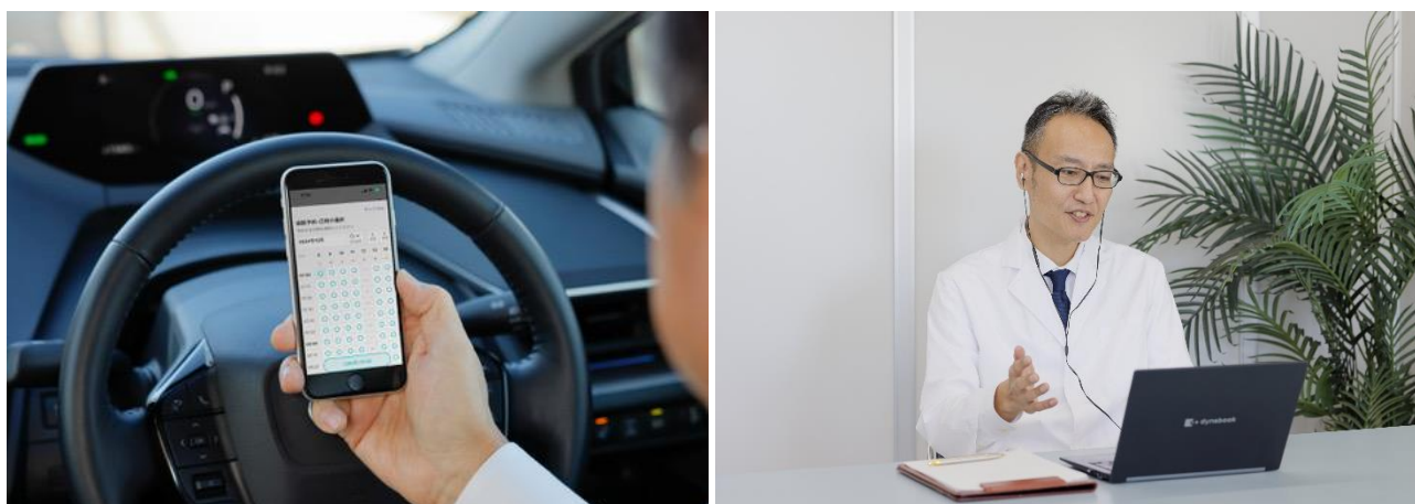
MY MEDICA in use